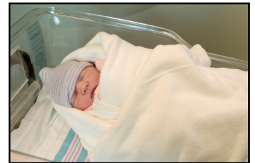
(New York Times)